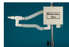
Aero/Vent Jr (Pole Mount)