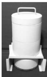
PET Auxiliary Shield CAPRAC-T, CRC-25W and CRC-55tW