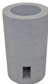
Positron Shield for Capintec Dose Calibrator Chamber