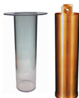
086-241 Well Insert