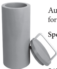
Auxiliary Shield for Well Counter Chamber for CAPRAC-T, CRC-25W and CRC55tW