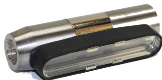
Shown with removable black protective rubber band

SSB3-2M Bullet Syringe Shield, 3 cc without glass SSB5-2M Bullet Syringe Shield, 5 cc without glass SSB10-2M Bullet Syringe Shield, 10 cc without glass