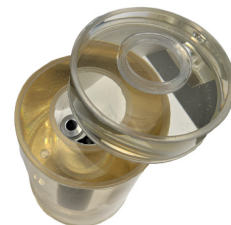
PTI-LDAS ClearView RS * Lu-177 Dose Administering Shield