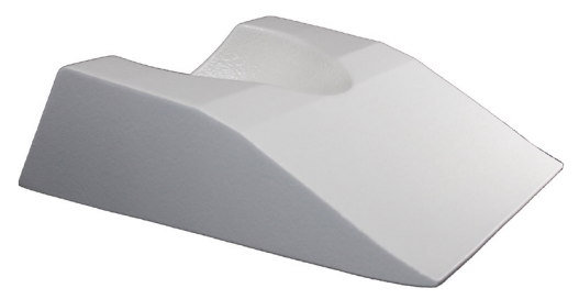
Dimensions: 14.5" W x 17.5" D x 4.5" H