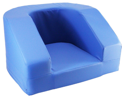
Dimensions: 19" W x 17" D x 9.5" H Flat Base

Includes two disposable pillows with cases