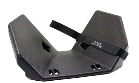
Dimensions: 21" W x 13" D x 9" H Flat Base