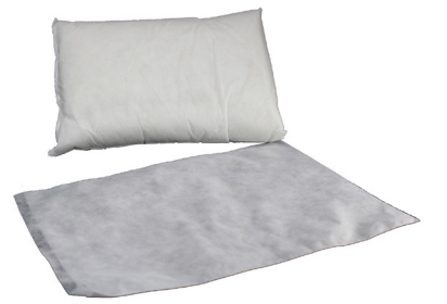
Dimensions: Pillows: 11" x 15" Cases: 12" x 16"

NMC-PIL Disposable Patient Pillows, 20/case NMC-CASE Disposable Pillow Cases, 20/case