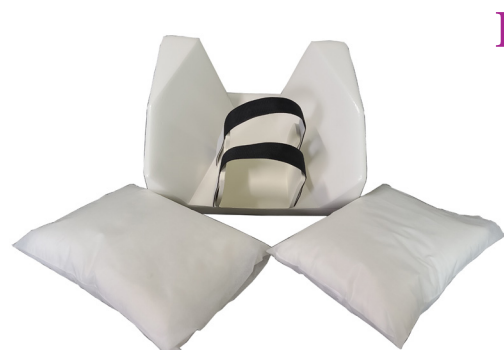
Dimensions: 20" W x 18" D x 9" H Flat Base

Black High Quality clear Carbon Fiber Finish