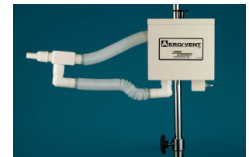
Aero/Vent Jr (Pole Mount)